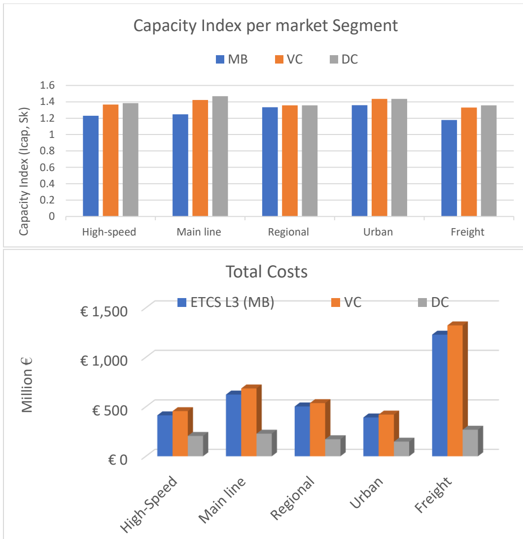
Figure 3. Comparative capacity and cost analysis of DC versus MB and VC for different rail segments